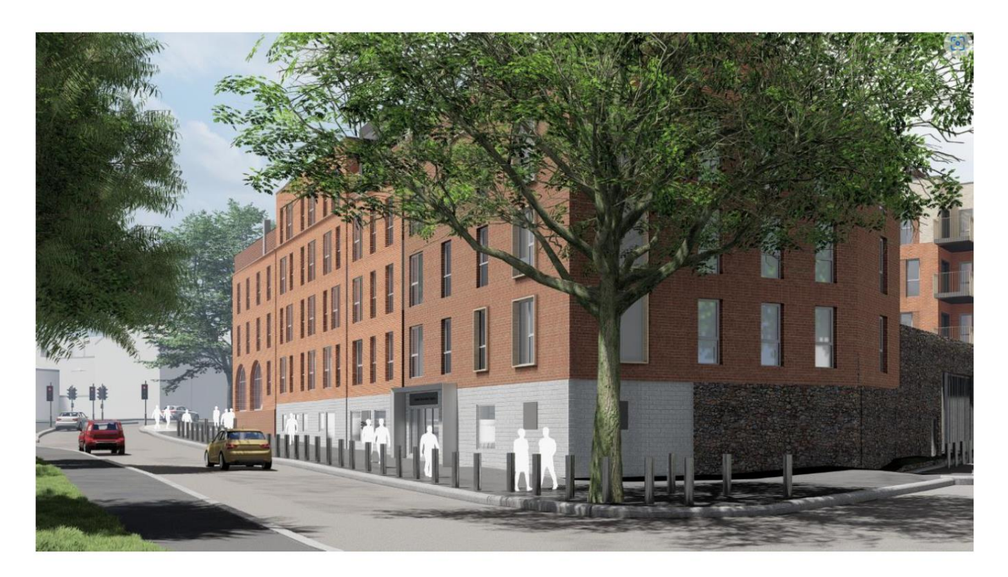
Figure 2 - Proposed 3D Visual Block